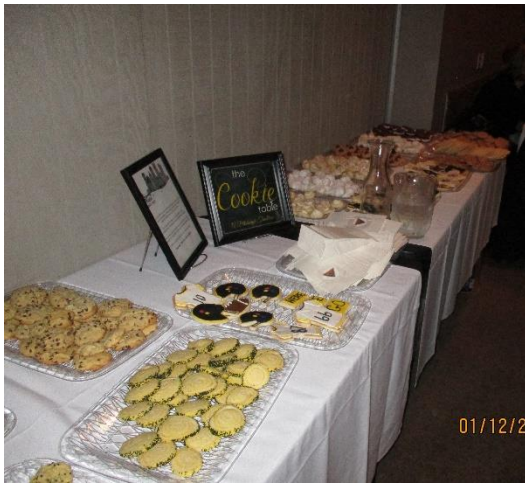
Cookie Table at the Deichler Reception