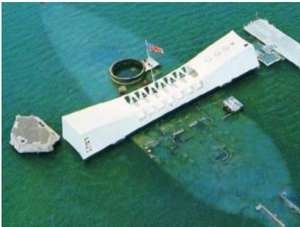
USS Arizona Memorial

The war ultimately ended in the defeat of the enemies of America. But many lessons were learned that have great significance to us today.